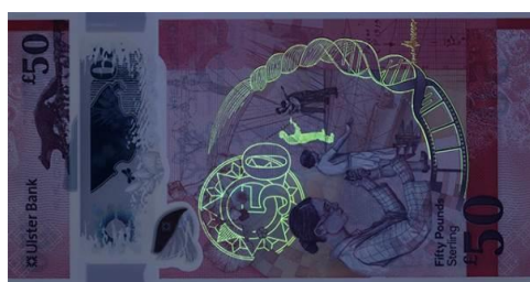
Genuine Ulster Bank (Rear)

Under UV, the front of a genuine Ulster Bank £50 note shows: flora in green, yellow and orange ink ; a pinecone in a green square; a '50' in green ink (in with the flora); and two serial numbers – one in green ink, and one in blue ink.