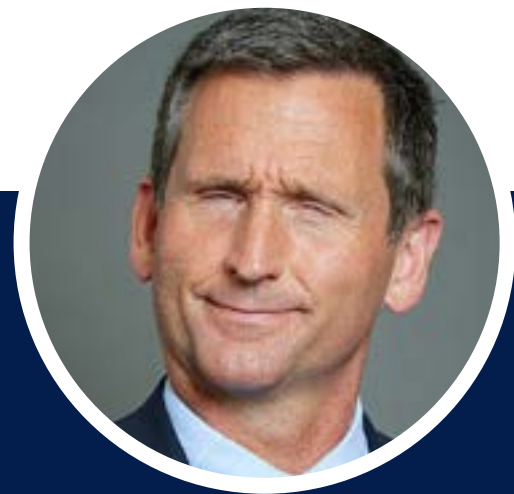
Lord Holmes of Richmond MBE